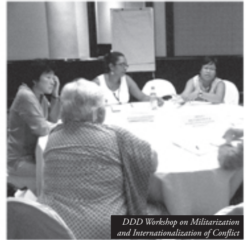
DDD Workshop on Militarization and Internationalization of Conflict

“One key concern would be how to bring production and consumption to economic discussions that are heavily only about distribution. In addition, who is the subject of rights? Are they persons, communities, or nations? What are Rights vis-a-vis Human Rights? The right to development defined as the right of persons but politically argued as right of states – how do we reclaim the discourse back as the right of persons but at the same time, address the issue of inequalities among states? What systems produce or do not produce justice?” - Gita Sen