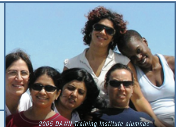
2005 DAWN Training Institute alumnae

www.dawnnet.org or email dti2011@dawnnet.org for inquiries