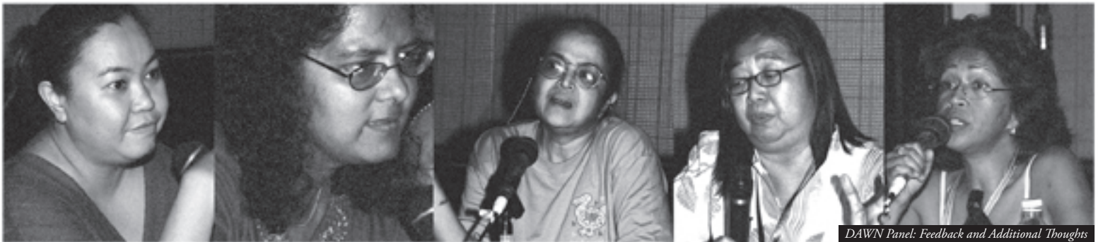
DAWN Panel: Feedback and Additional Thoughts