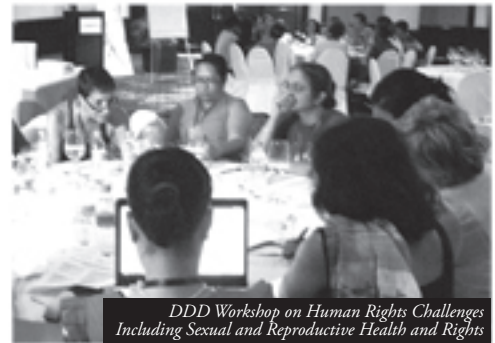
DDD Workshop on Human Rights Challenges Including Sexual and Reproductive Health and Rights