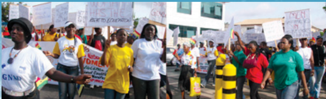
Protest March organized by the Network of Women's Rights in Ghana (NETRIGHT), which sought to honour the pledge by the Mills Administration in Ghana to appoint more women into the cabinet