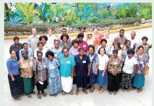
Vois Blong Mere Solomon Media Workshop Group