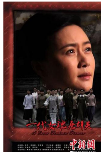
A great Feminist Pioneer (2019)