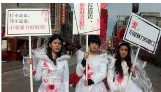
Blood-stained Wedding Gowns – Chinese Young Feminists Took to the Streets for the First Time on Valentine’s Day 2012.