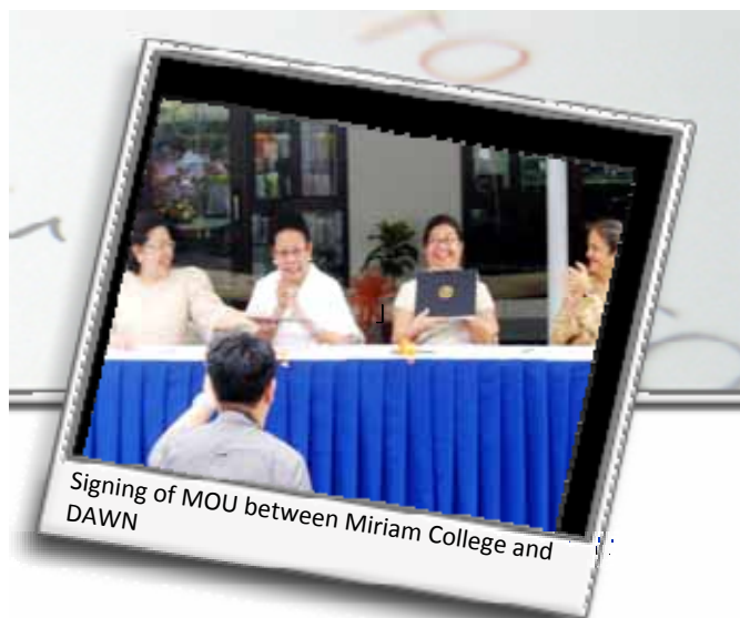
Signing of MOU between Miriam College and DAWN