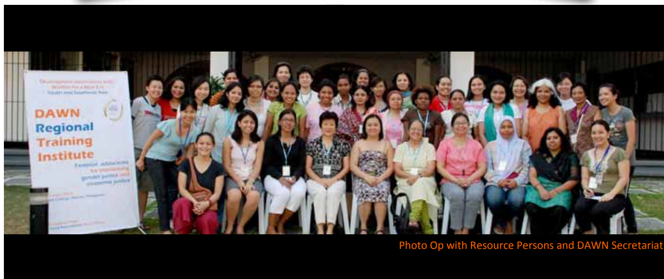
Photo Op with Resource Persons and DAWN Secretariat