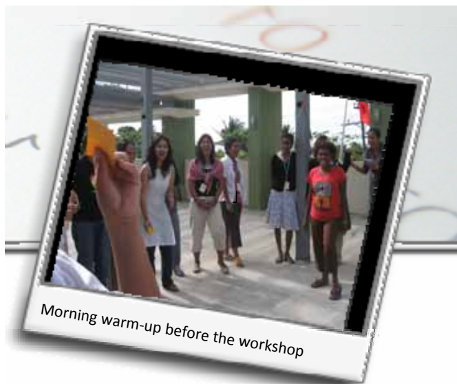
Morning warm-up before the workshop