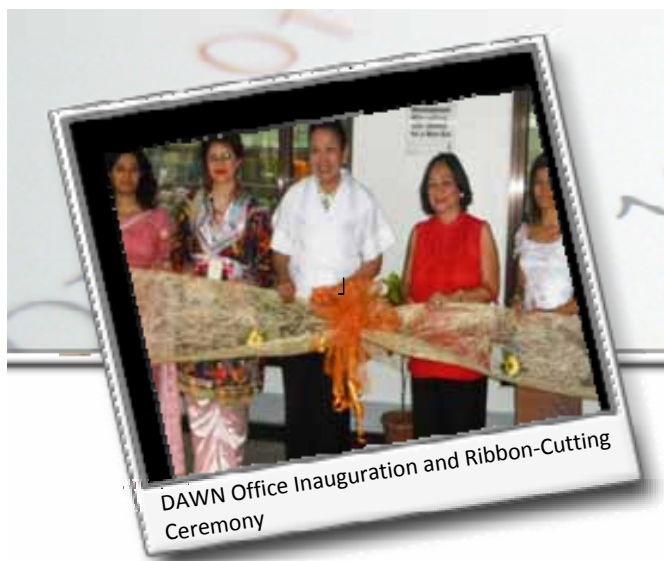
DAWN Office Inauguration and Ribbon-Cutting Ceremony