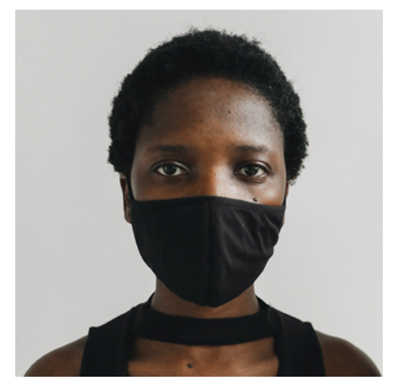
<u>Using gender analysis matrixes to integrate a</u> <u>gender lens into infectious diseases outbreaks</u> <u>research</u> - Health Policy and Planning Journal