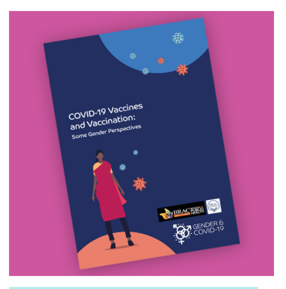
<u>COVID-19 Vaccines and Vaccination: Some</u> <u>Gender Perspectives</u> - Gender & Covid-19 Project at the BRAC School of Public Health