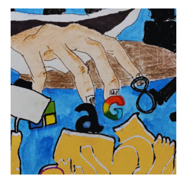
Davos 2022 Round-Up - DataSyn